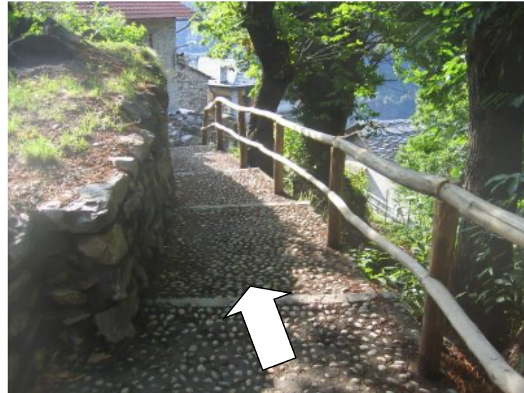
The steps are wide and cobbled