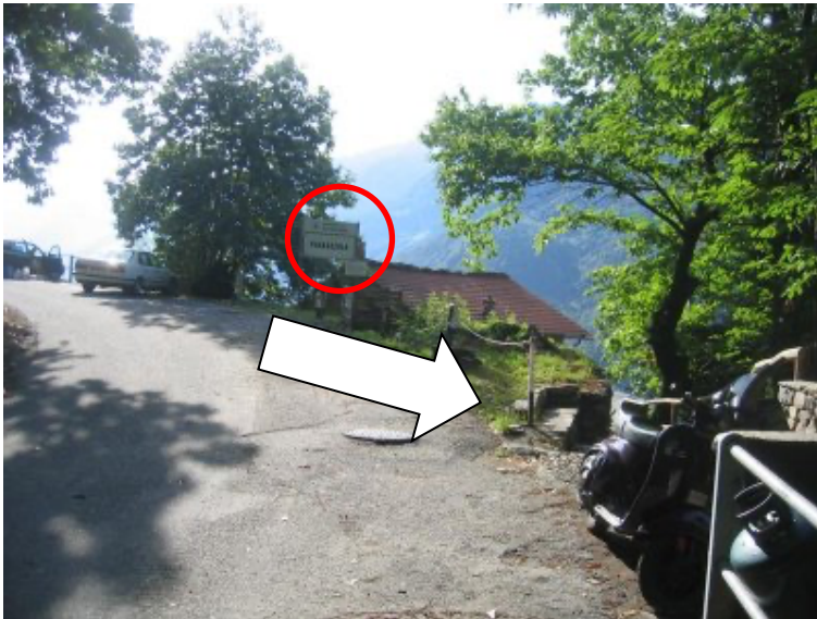
Walk down the wide path in front of the Pianazzola town sign